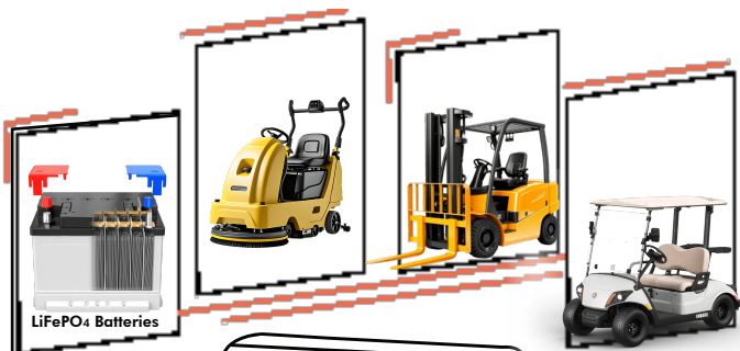
LiFePO 4 Batteries